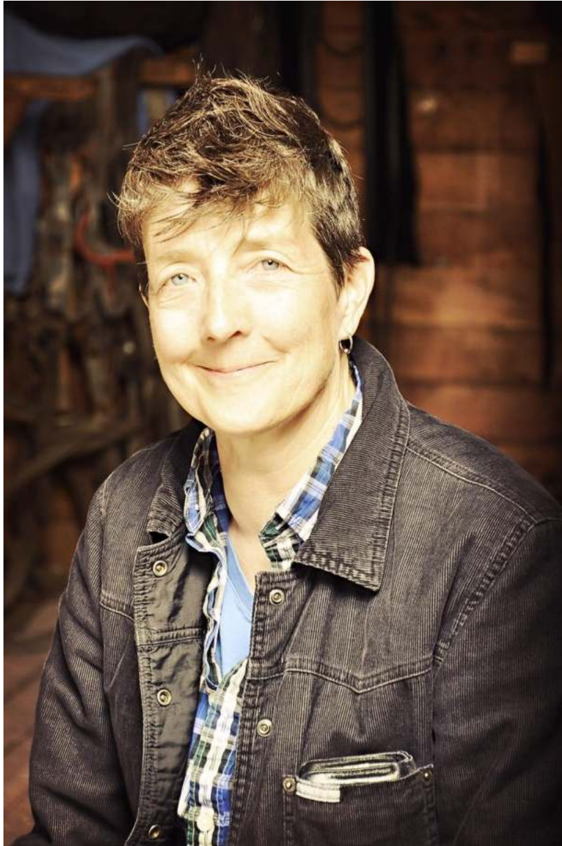
This is a photo of the Good Host.